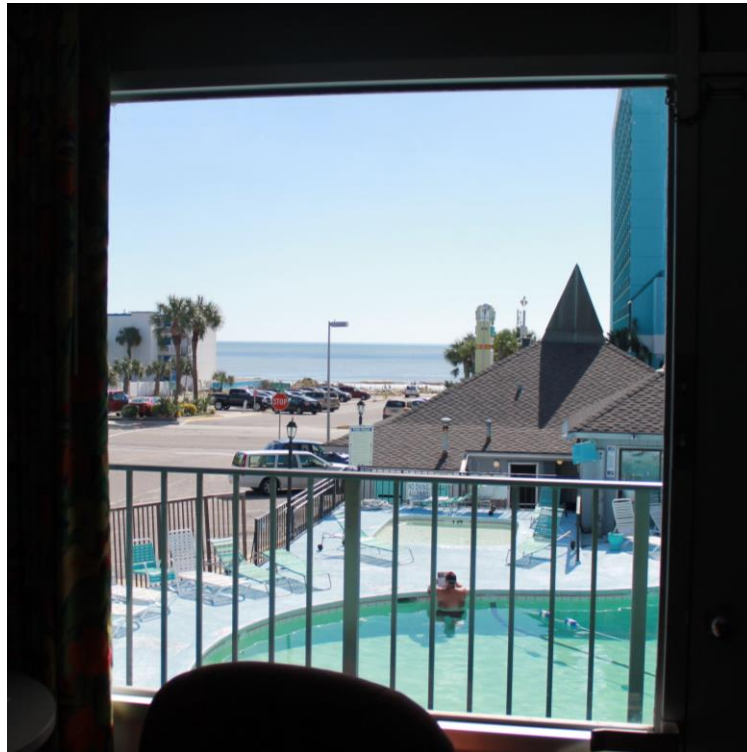
Figure B.10 View from Room 234.