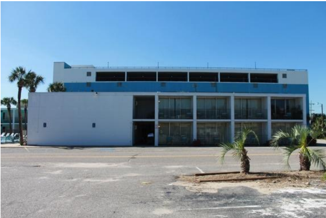
Figure 2.6 North elevation, 1967-1969 addition.