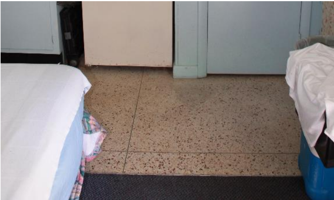
Figure 2.23 Terrazzo flooring in Room 402.