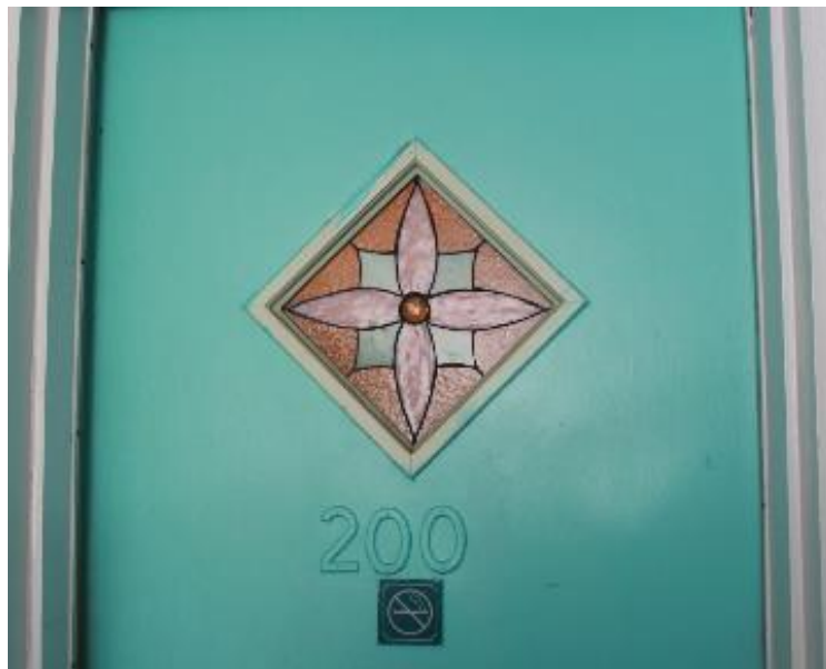
Figure 2.21 Stained glass window, Room 200.